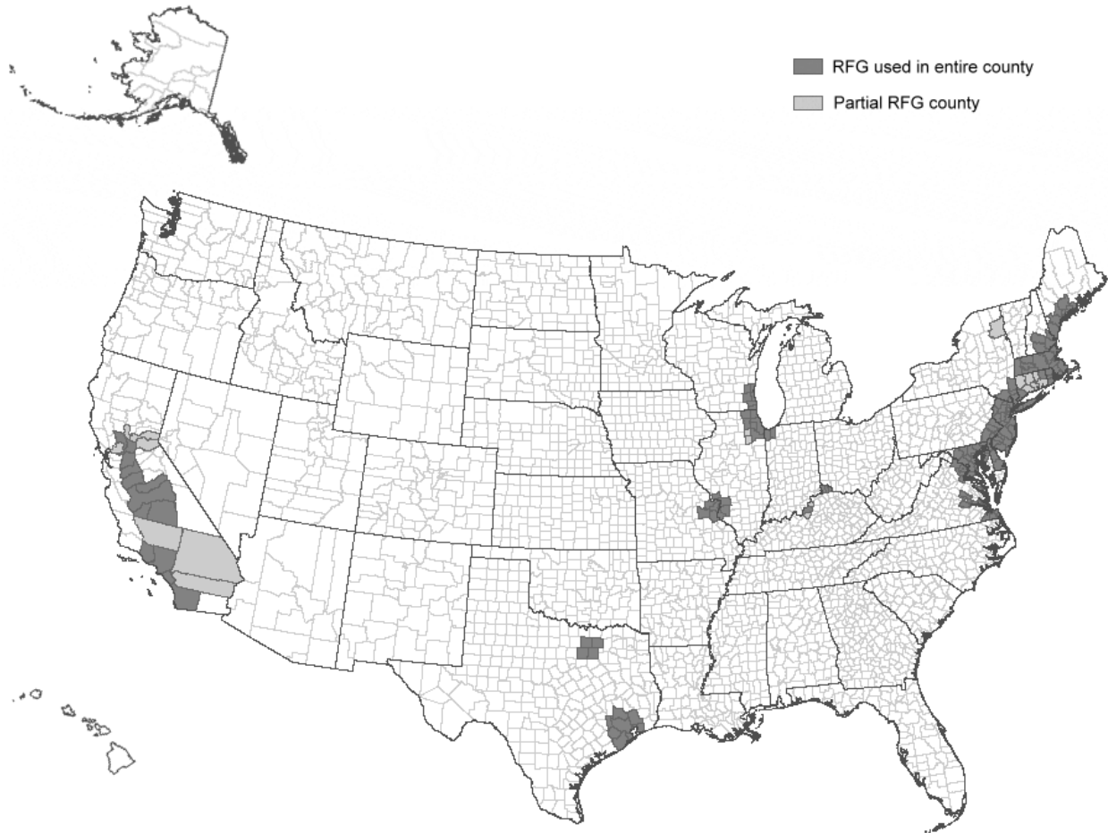
Figure C.3. Counties Where Reformulated Gasoline is Sold

Note: Reformulated gasoline (RFG) is a motor gasoline specially formulated to achieve significant reductions in vehicle emissions of ozone-forming and toxic air pollutants. The Clean Air Act of 1990 mandates reformulated gasoline use in areas with ozone-air pollution problems, but some of these counties opted-in to the RFG program.